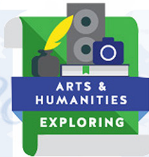
ARTS & HUMANITIES CAREER EXPLORING