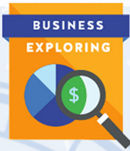
BUSINESS CAREER EXPLORING