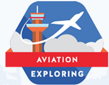
AVIATION CAREER EXPLORING