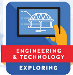
ENGINEERING & TECHNOLOGY CAREER EXPLORING