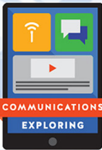
COMMUNICATIONS CAREER EXPLORING