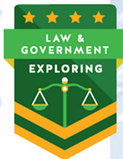
LAW & GOVERNMENT CAREER EXPLORING