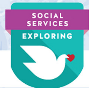
SOCIAL SERVICES EXPLORING